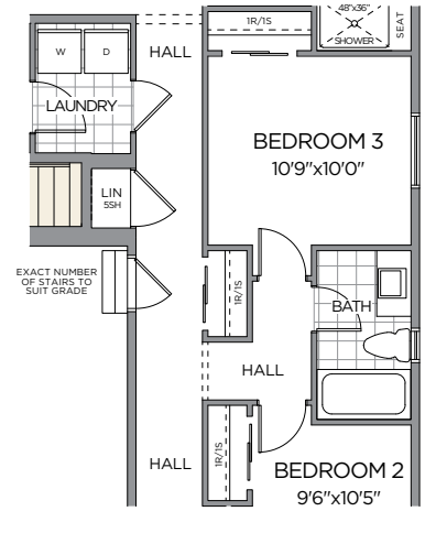
GROUND FLOOR PLAN OPT. 3 BEDROOM (PRIMARY SUITE)