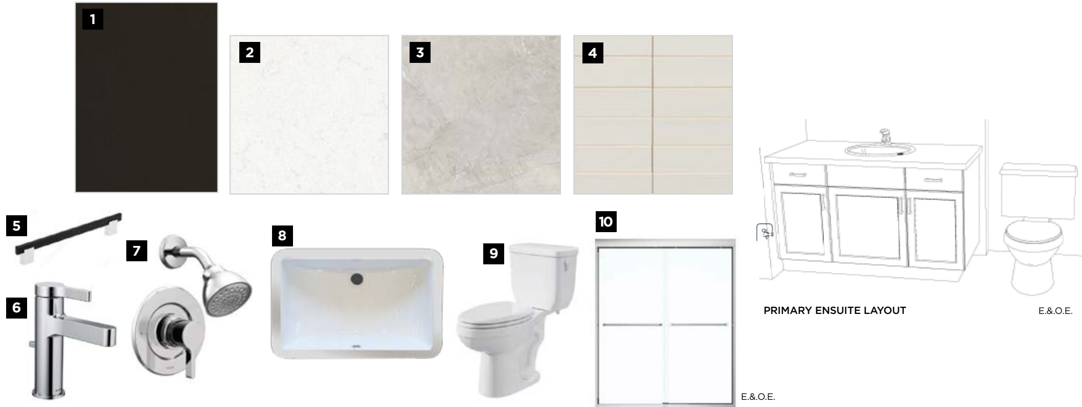
PRIMARY ENSUITE LAYOUT

A SUMPTUOUS PRIMARY ENSUITE YOUR COZY PRIVATE RETREAT